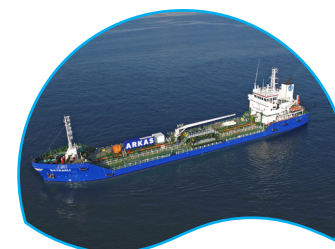
BAYRAKLI | 3.813 DWT 2017