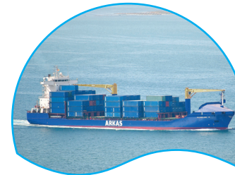
TİMUÇİN | 1.122 TEU 14 March 2013