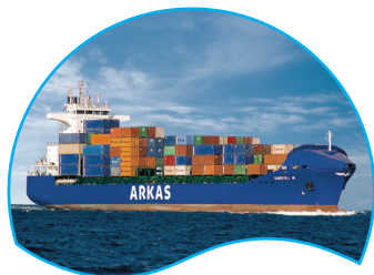
GABRIEL | 1.221 TEU 17 September 2004