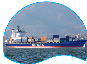
ROZA | 1.445 TEU 1 July 2007