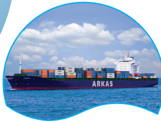
PIERRE | 2.837 TEU 15 May 2015