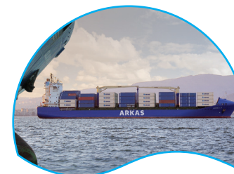
LUCIEN G. | 1.199 TEU 9 August 2002