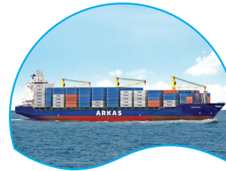
MarchHA | 2.474 TEU 10 March 2015