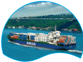
STANLEY | 2.824 TEU 7 July 2015