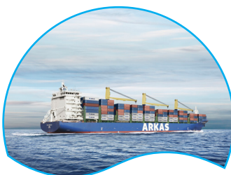
LUCIEN | 2.586 TEU 5 April 2017