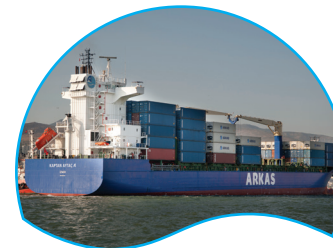
KAPTAN AYTAÇ | 1.157 TEU 17 August 2015