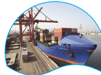
YİĞİTCAN | 1.208 TEU 26 October 2001