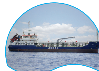
URLA 1 | 1.646 DWT 2009