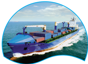
MARGUERITE | 1.529 TEU 4 June 2005