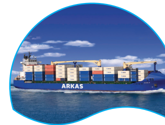
DIANE | 1.604 TEU 29 December 2008