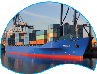
CORELLI | 1.445 TEU 27 October 2009