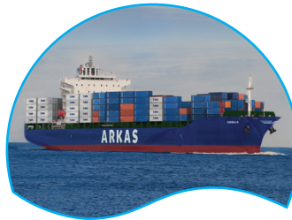
EMMA | 2.837 TEU 8 September 2014