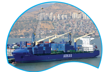
WANDA | 1.604 TEU 6 August 2009