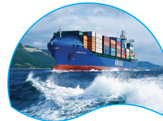
AURETTE | 1.199 TEU 2 June 2017