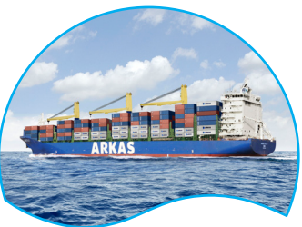
AURETTE | 2.586 TEU 12 May 2002