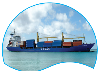
PHILIPPE | 907 TEU 24 August 2013