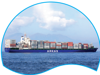
SINE | 2.824 TEU 16 March 2015