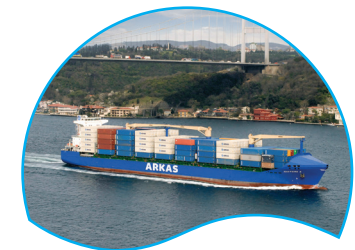
JEAN PIERRE | 1.604 TEU 14 December 2007