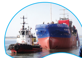
YILDIZBURNU | 1.770 DWT 2011