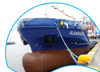
ALSANCAK 2 | 1.763 DWT 2011