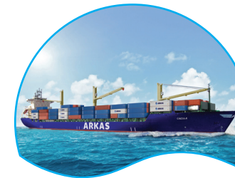
CINZIA | 2.452 TEU 26 April 2016