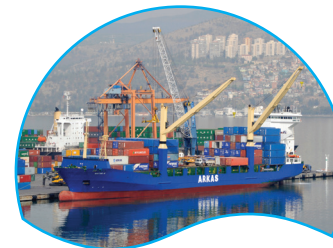
MarchINE | 1.139 TEU 17 March 2010