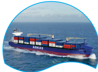
MICHEL | 1.604 TEU 15 November 2007