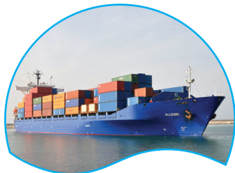
ALLEGRI | 1.445 TEU 6 November 2009