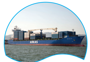
MATILDE | 1.199 TEU 18 June 2012