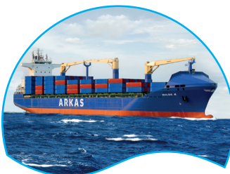
HILDE | 1.529 TEU 13 July 2005