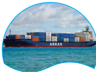
GISELE | 2.702 TEU 12 June 2015