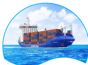
DIONYSSIS | 1.022 TEU 29 October 2018