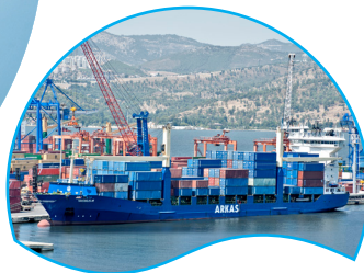
VASSILIS | 1.024 TEU 24 October 2018