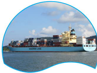
MAERSK JAIPUR | 2.824 TEU 22 May 2017