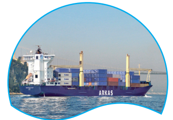
INGA | 1.139 TEU 22 April 2010