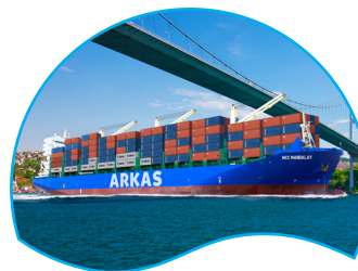
ANDREA | 2.586 TEU 19 July 2017