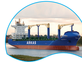
BERNARD | 1.604 TEU 22 October 2009