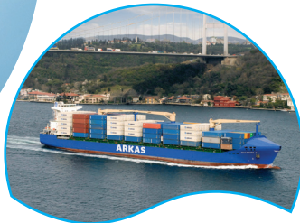
CLAUDE | 1.604 TEU 11 September 2008