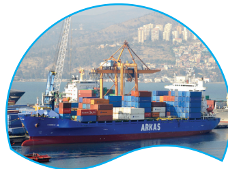
TOMRİZ | 1.445 TEU 1 June 2007