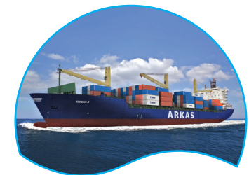
TEOMAN | 2.452 TEU 5 March 2016