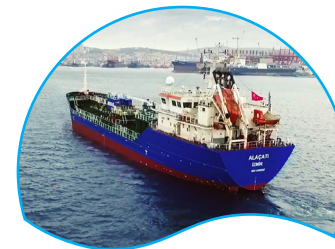
ALAÇATI | 4.138 DWT 2017