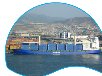
ALEXANDRA | 1.024 TEU 14 August 2018