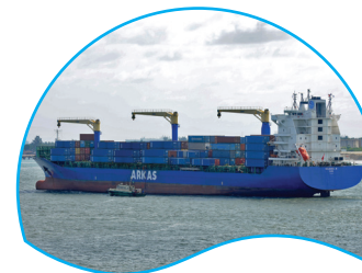
GÜLBENİZ | 2.478 TEU 18 April 2011