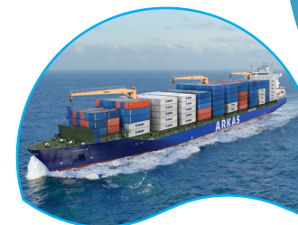
VIVIEN | 2.478 TEU 7 May 2010