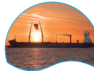
CRISTINA | 1.604 TEU 3 May 2007