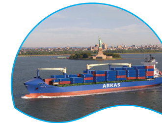
MARIO | 1.604 TEU 11 July 2007