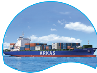
SASKIA | 2.824 TEU 3 June 2015