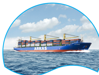
FUNDA | 2.586 TEU 1 November 2017