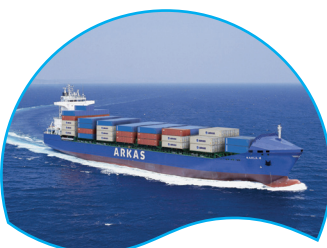
KARLA | 1.221 TEU 23 July 2004