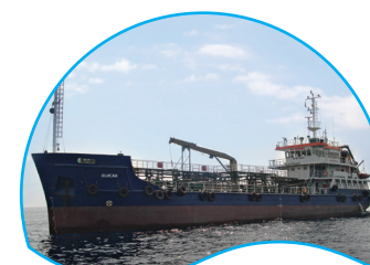
ULUCAK | 1.634 DWT 2009