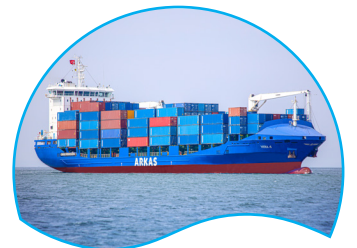
VERA | 1.024 TEU 14 August 2018